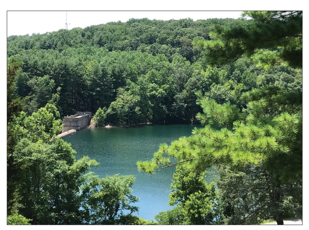
Figure 1: Land use planning and zoning in Baltimore County help to direct growth away from important forest lands such as those surrounding the County's water supply reservoirs.