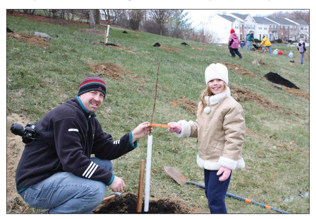
Figure 3. Increases in urban tree canopy can be achieved through programs for reforestation of public lands, such as the Town of Leesburg, Virginia's efforts to reforest dry ponds.