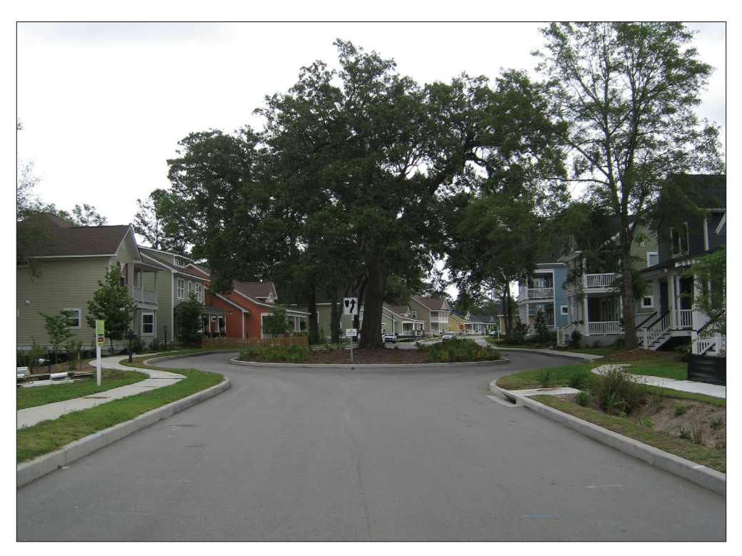
Figure 2: The Oak Terrace Preserve community in North Charleston, SC employed forest-friendly site design techniques that allowed existing mature trees to be preserved and protected.