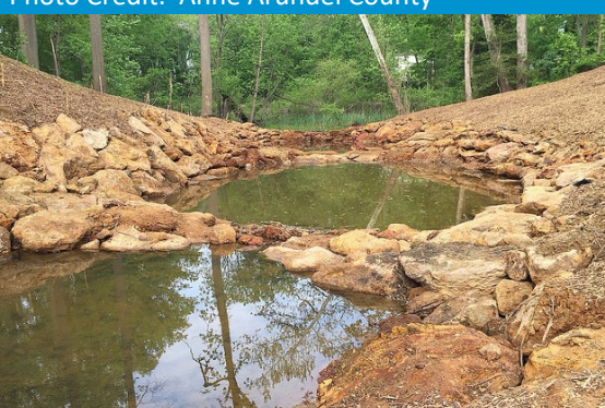
A new SPCS solved the problem using County stormwater fees.