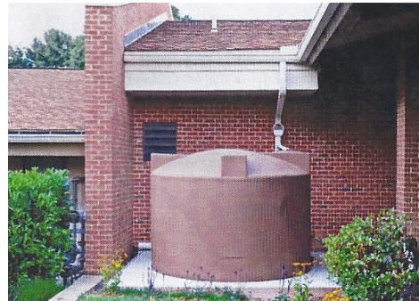
1,500 gallon cistern was installed to capture roof runoff. Water is used for irrigation.

By connecting existing gutters to a 1,500 gallon cistern, the church was able to capture roof rainwater and mitigate overflow to the retention pond. Additionally, with the help of 60 church volunteers, two rain gardens were installed, providing a myriad of benefits: beautification of the church property; water uptake and filtration; provision of wildlife habitat; and an opportunity to strengthen the message of environmental stewardship with parishioners. The garden absorbs 2,300 gallons of water per inch of rainfall, improving water quality in Bynam Run. The church is now a certified Bay-Wise property via the Maryland Bay-Wise Program.