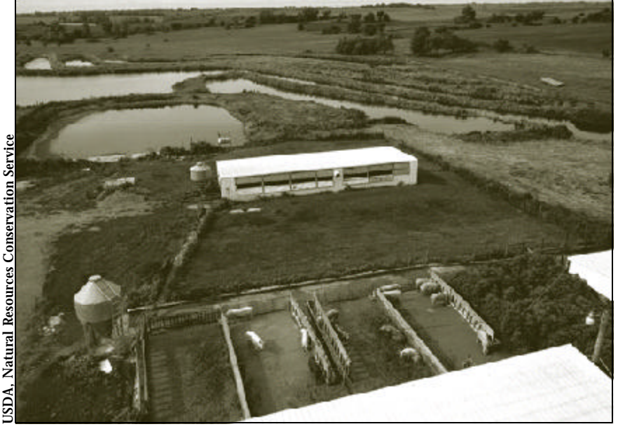
This hog operation in Taylor County, Iowa, uses a wetland system constructed on a series of hillside terraces to filter and purify wastewater. Water quality tests indicated that the effluent from the treatment wetland was cleaner than that required for wastewater treatment plants.