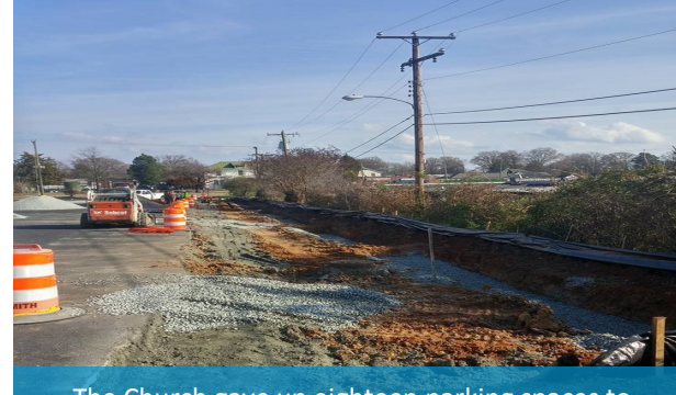
The Church gave up eighteen parking spaces to make room for the rain garden.

Community Engagement: After the project was installed, the congregation held a three-week workshop on "feeding the mind, body and spirit." Community members who attended the Saturday workshop received a free 4' by 8' raised bed that was built and delivered to their homes. Gardening programs for the Latino community are also held at the site. Youth from nearby schools and the juvenile justice system volunteer at the garden to receive community service and civic engagement hours.